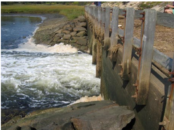
The Chequesset Neck Road Dike located at the entrance to Herring River.

Woods Hole Group was contracted to develop a comprehensive hydrodynamic and salinity model that is central in development of the restoration plan. This high resolution (2 meter scale) and complex model allows for evaluation of specific questions about the potential changes to surface water flow, velocity, and salinity levels within the estuary. The model is also applied to numerous alternative restoration scenarios to assess potential restoration gains, upland flooding concerns, improved salinity distribution, etc.